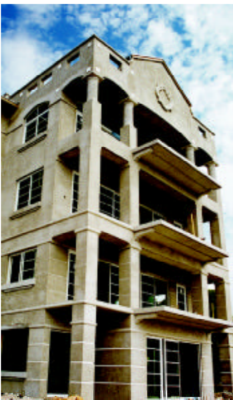
Designed by world class architects, the Intracoastal Building starting to unveil its rich mediterranean architectural details.

"While the project is two-thirds sold," says Rene, "there are nine units left which represent an excellent range of prices and sizes." For instance, four units remain in the intracoastal building, with prices starting at $549,000 for a two bedroom plus den and 3 bath residence with more than 2,400 square feet including a beautiful terrace overlook-